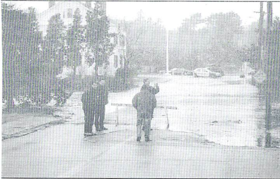
High tide causes flooding across Washington Street in the Bluefish River area.